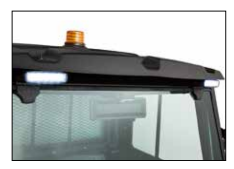
■ LED Front Worklights (x2) (RTV-X900 & RTV-X1120D only) VC5050