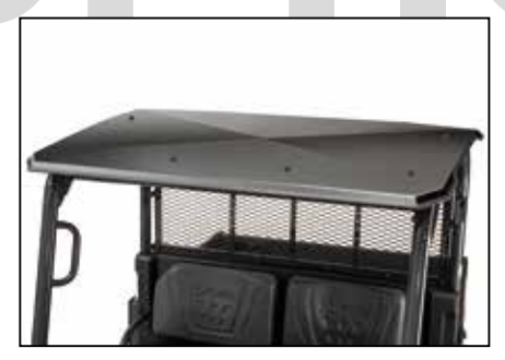
■ Metal FOPS Canopy (RTV-X900 & RTV-X1120D only) VC5000