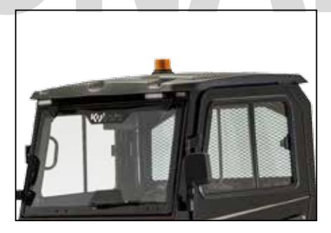
■ Plastic Canopy (RTV-X900 & RTV-X1120D only – Shown with VC5056 LED Strobe Light) VC5011