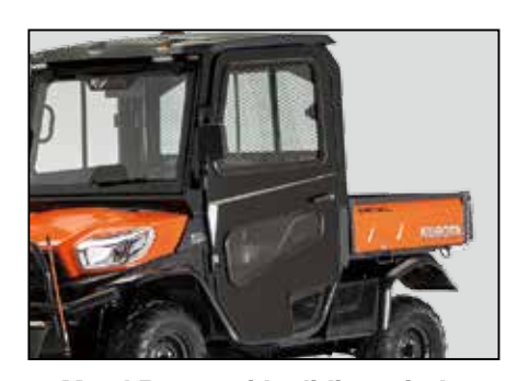
■ Metal Doors with sliding windows (RTV-X900 & RTV-X1120D only) VC5090 - Black VC5091 - Orange