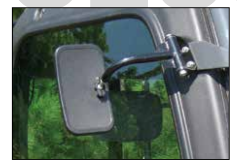
■ RTV Mirror Kit (RTV-X1100C only) V5059 – Cab