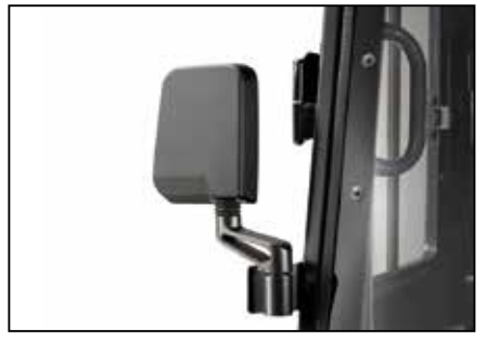
■ RTV Mirror Kit (RTV-X900 & RTV-X1120D only) VC5076