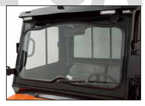
Laminated Windshield (RTV-X900 & RTV-X1120D only) VC5020