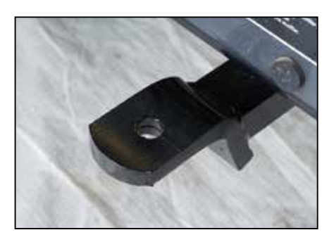
■ Trailer Hitch Ball Mount Kit V5200