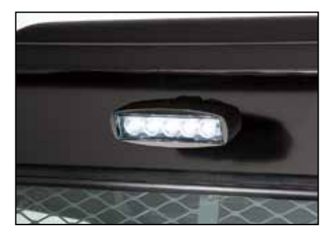
■ Rear Work Light (RTV-X900 & RTV-X1120D only) VC5051