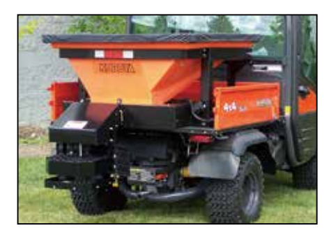
■ Cargo Box Spreader (RTV-X900 & RTV-X1100C only) V5005