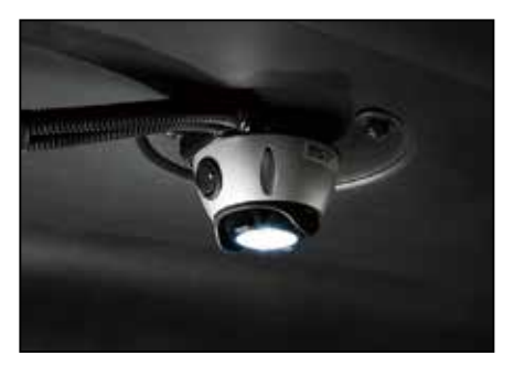
■ Dome Light (RTV-X900 & RTV-X1120D only) VC5053