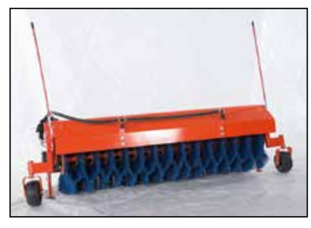
■ 60" Hydraulic Rotary Broom V5260