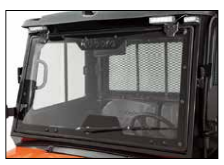
■ Poly Windshied (RTV-X900 & RTV-X1120D only) VC5023