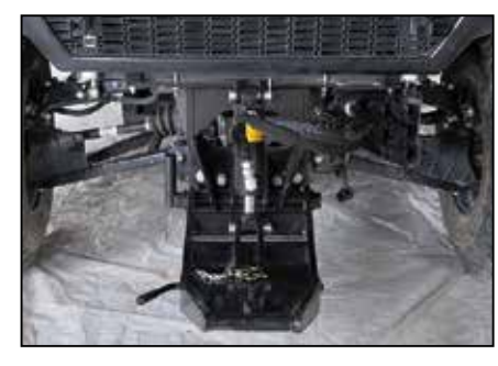
■ Front Hydraulic Quick Hitch V5289