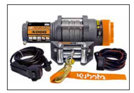
■ Winch Kit (4,000lbs capacity) V5244