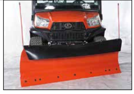
■ Commercial 72" Hydraulic Straight Blade V5290