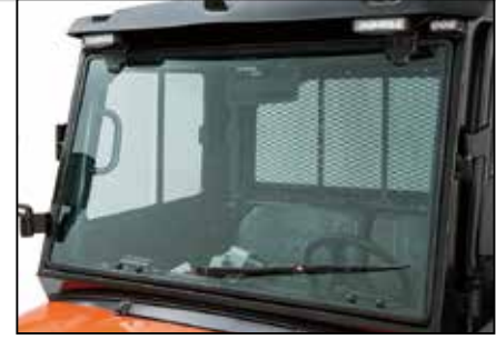
■ Tempered Glass Windshield (RTV-X900 only) VC5025