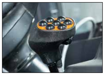
■ Hydraulic Control & Valve System V5232 – 2-function Control & Valve V5233 – 3-function Hydraulic Valve Upgrade Kit (not shown)