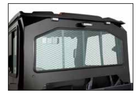
■ Rear Panel (RTV-X900 & RTV-X1120D only – Shown with optional rear worklights and flashers) VC5040