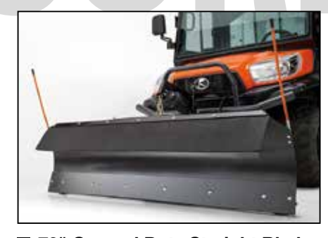
■ 72" General Duty Straight Blade with Quick Hitch V5008