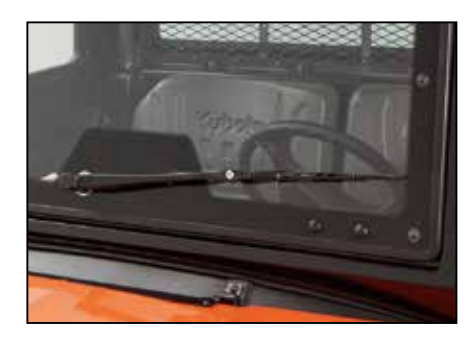
■ Wiper (RTV-X900 & RTV-X1120D only) VC5030