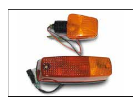
■ Turn Signal/Hazard Light Kit V5237