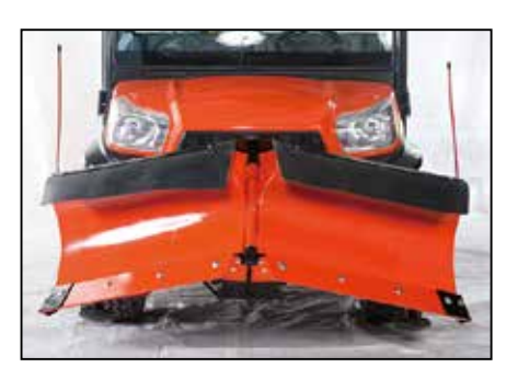
■ Commercial 72" V-Blade V5291